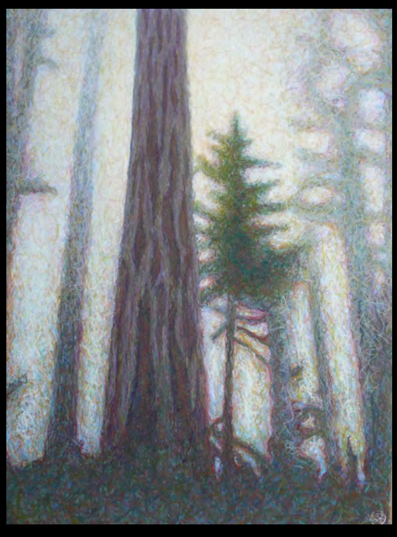
30"x22" oil pastel on paper