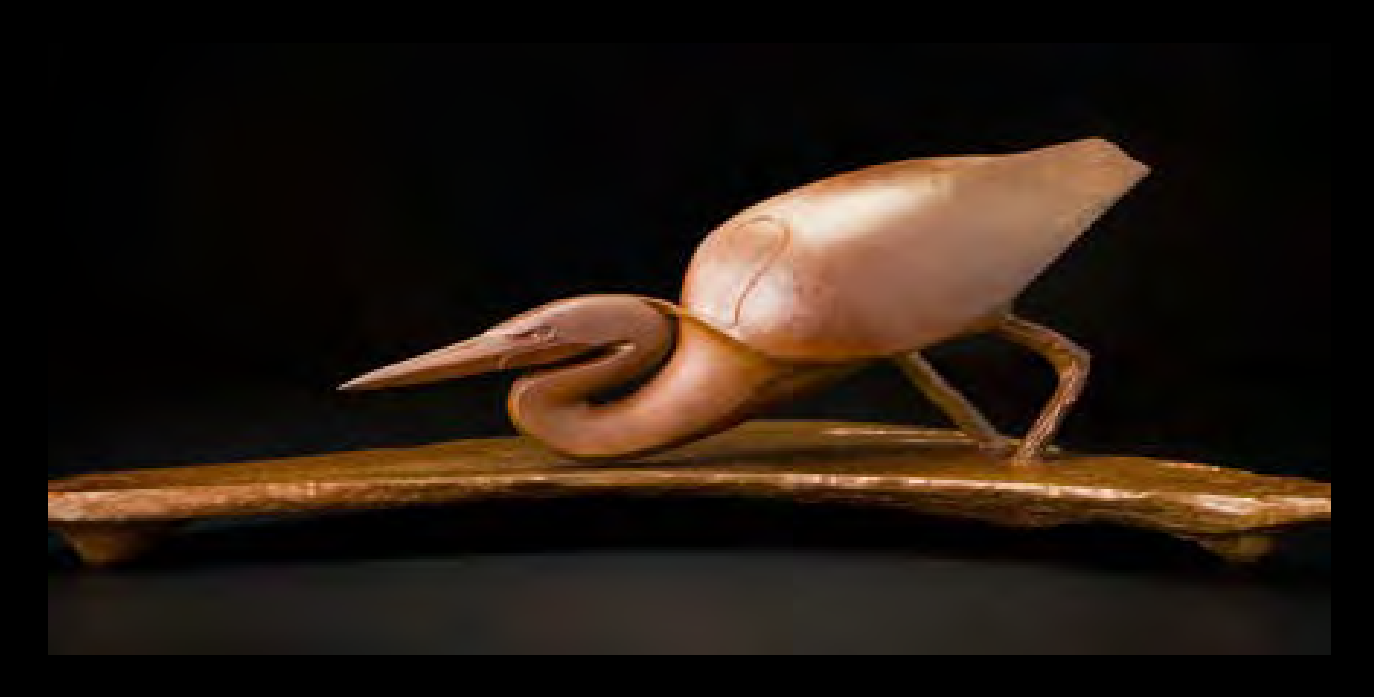
18" x 10" x 5" Bronze limited edition of 9

In Geometry the existence of the point precedes creation of the line. This is evidenced in the natural world as the seed begets shoot; birth begets lifeline; destination begets journey, and a celestial body begets a line of gravitational force with all other celestial bodies. In this piece, the prey begets the predator's trajectory and purpose.